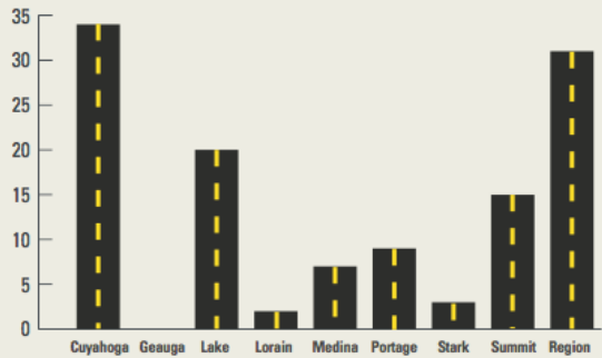
Percent of jobs that are transit accessible, by county

Less than one-third (31%) of the jobs in Northeast Ohio are transit accessible, or can be accessed by public transit in 90 minutes or less.